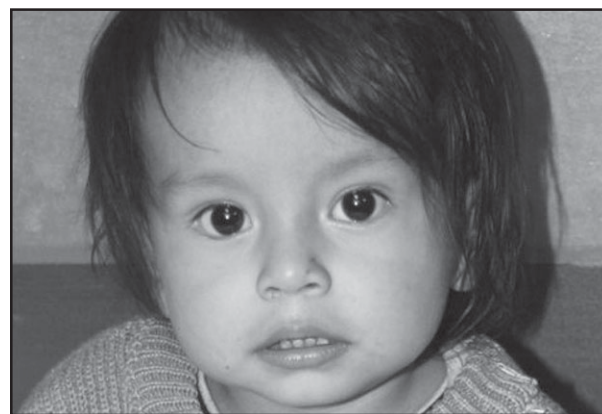
What a Cutie!

Many people helped to make this trip a success. Thank you! To all the medical personnel who traveled to Guatemala, our deepest thanks for donating your time and talents to help children in need.