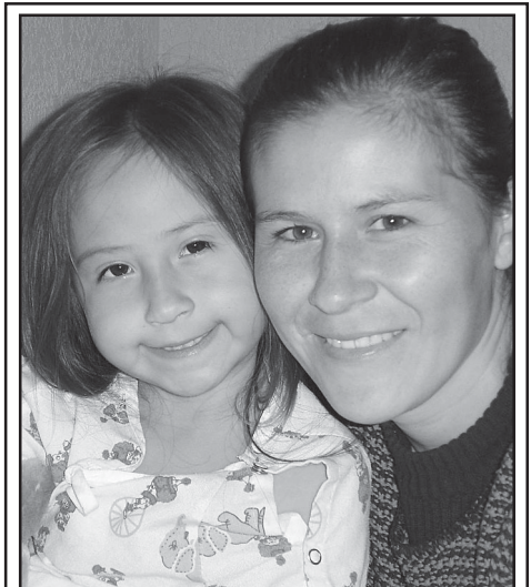
Mother and daughter helped by HTC