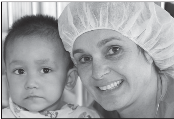
On the Way to Health